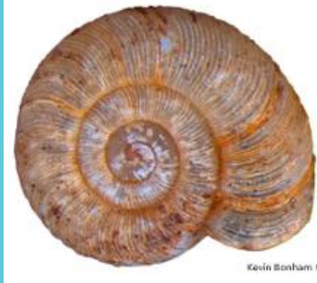
Kevin Bonham ©

The Ammonite Snail ( Ammoniropa vigens ) is a tiny, very flat land snail, yellow to off-white or greyish in colour, with a very wide umbilicus which is 30 to 40% of shell width. The Ammonite Snail is endemic to Tasmania and occurs only in the Hobart area. The species occurs in a variety of forest habitats, but has only been found under dolerite rocks. There are currently only two extant populations known, with an area of occupancy of 2 ha and a total population size of as little as 200 individuals. The principal threats to the species include fire, and urban sprawl and its associated effects - including weeds, exotic invertebrates, and habitat fragmentation. The main objective for the management of the Ammonite Snail is to decrease its extinction risk by maintaining, improving and increasing extent and quality of habitat. This species was previously known as Discocharopa vigens .