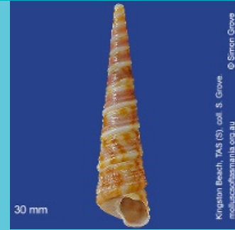
Kingston Beach, TAS (S), coll. S. Grove.