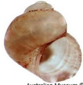
Australian Museum ©

A complete species management profile is not currently available for this species. Check for further information on this page and any relevant Activity Advice.