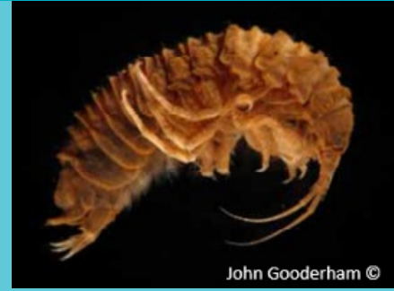
John Gooderham ©

Endemic Status: Endemic in Tasmania and restricted